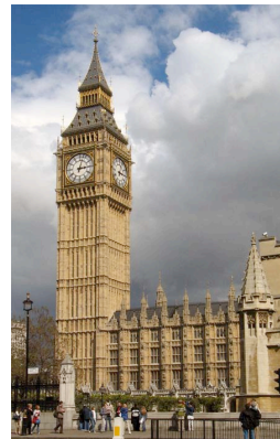
Big Ben, London

Over 100 years ago, one of the clock faces of the Royal Liver building was used as a dining table.