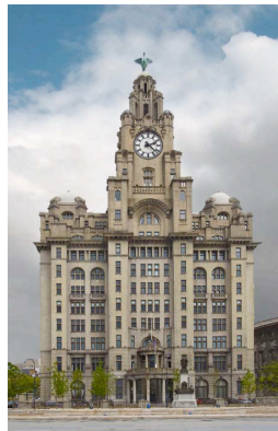
Royal Liver, Liverpool

This task is about two large circular clocks on famous buildings.